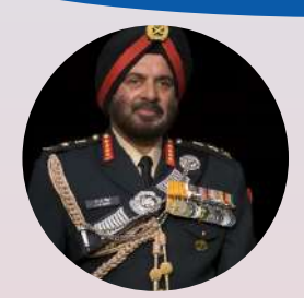
Gen JJ Singh(Retd) Former Governor & Former Chief of Army Staff, Indian Army