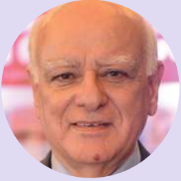
ANIL RAZDAN, IAS (RETD) Former Secretary (Power), Govt. Of India