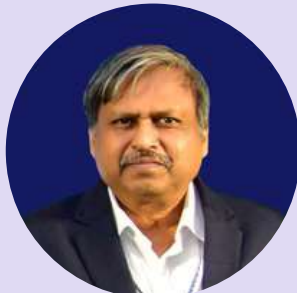
MAKP SINGH Former Member-HE, CEA, Ministry of Power, Government of India