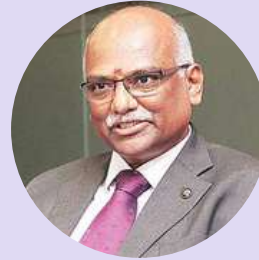
R GANDHI Former Deputy Governor Reserve Bank of India