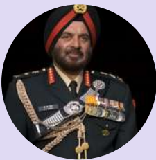
Gen JJ Singh PVSM, AVSM, VSM, ADC (Retd) Former Governor & Former Chief of Army Staff, Indian Army