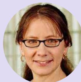
CLEO PASKAL Senior Fellow for Indo-Pacific at FDD, USA