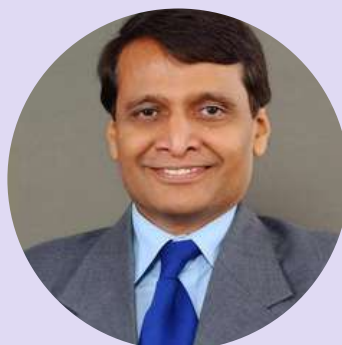
Suresh Prabhu Former Union Minister for Civil Aviation, Railways, Commerce & Industry, Chemicals & Fertilizers, Environments & Forests & Power, Govt. of India Former G20 & G7 Sherpa & Chancellor-Rishihood University