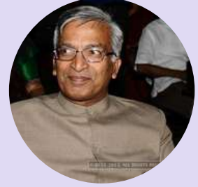
SURESH GOEL, IFS (RETD) Former Secretary, Ministry of External Affairs, Govt. of India