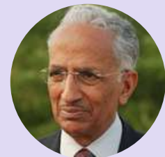
Prakash Singh IPS (Retd) Former DGP-Uttar Pradesh & Assam Former DG-BSF, Govt. of India