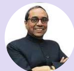
Shashank IFS (Retd) Former Foreign Secretary, Govt. of India