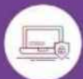
Cyber Threat Protection Software