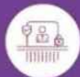
Cloud Access Security Systems