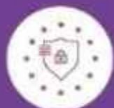
Cyber Security Risk Management