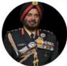
Gen JJ Singh PVSM, AVSM, VSM, ADC (Retd) Former Governor & Former Chief of Army Staff, Indian Army