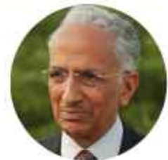
Prakash Singh IPS (Retd) Former DCP-Uttar Pradesh & Assam Former DC-BSF, Govt. of India