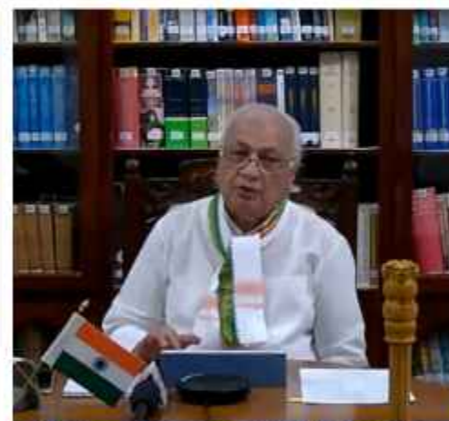
Hon Governor of Kerala Arif Mohammed Khan