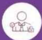
IT Assets & Security Systems