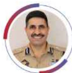
GARIB DASS IPS

Former DG-Naval Armament Inspection, Indian Navy