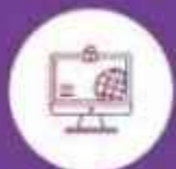
Web Protection & Encryption Technology Solutions