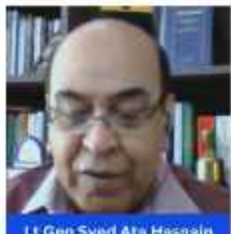
Lt Gen Syed Ata Hasnain