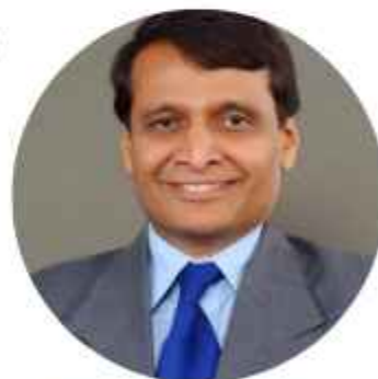
Suresh Prabhu Former Union Minister for Civil Aviation, Railways, Commerce & Industry, Chemicals & Fertilizers, Environments & Forests & Power, Govt. of India Former G20 & G7 Sherpa & Chancellor-Rishhood University