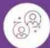
Network Security Monitoring Tools