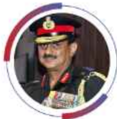
LT GEN MU NAIR PVSM, AVSM, SM

Former Union Minister for Civil Aviation, Railways, Commerce & Industry & Power, Govt of India & Former G20 & G7 Sherpa & Chancellor-Rishihood University