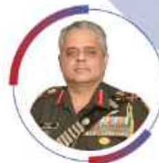
LT GEN RAJ SHUKLA PVSM, AVSM, SM, ADC

Former Secretary, MeitY, Government of India