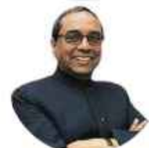
Shashank IFS (Retd) Former Foreign Secretary, Govt. of India