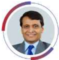
CA SURESH PRABHU

Former Union Minister for Civil Aviation, Railways, Commerce & Industry & Power, Govt of India & Former G20 & G7 Sherpa & Chancellor-Rishihood University