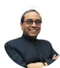
Shashank IFS (Retd) Former Foreign Secretary, Govt. of India