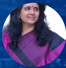
N S NAPPINAI Advocate, Supreme Court of India