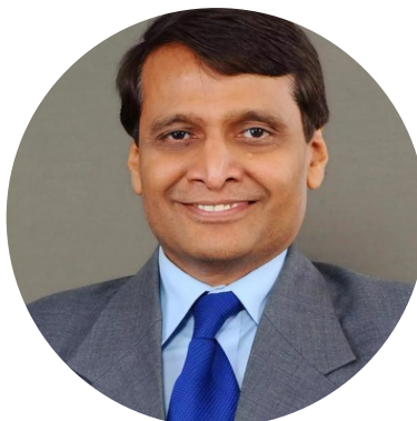
Suresh Prabhu Former Union Minister for Civil Aviation, Railways, Commerce & Industry, Chemicals & Fertilizers, Environments & Forests & Power, Govt. of India Former G20 & G7 Sherpa & Chancellor-Rishihood University