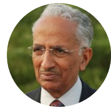
Prakash Singh IPS (Retd) Former DGP-Uttar Pradesh & Assam Former DG-BSF, Govt. of India