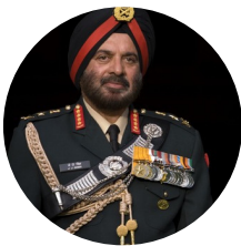
Gen JJ Singh PVSM, AVSM, VSM, ADC (Retd) Former Governor & Former Chief of Army Staff, Indian Army