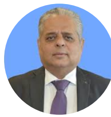
LT GEN RAJ SHUKLA, PVSM, YSM, SM, ADC (RETD) Member-UPSC Former GOC-in-C, ARTRAC, Indian Army