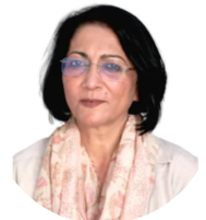
PRABHA RAO, IPS (RETD) Former Special Secretary, Cabinet Secretariat, Government of India