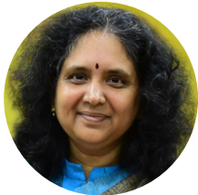
NAPPINAI NS Advocate, Supreme Court of India & Founder - Cyber Saathi Foundation